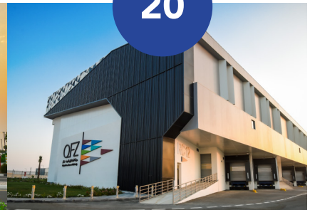
Regional Distribution Hubs