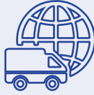
Logistics & Trading