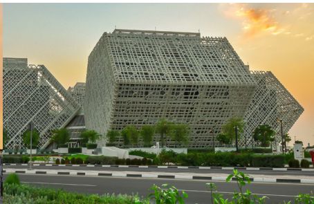
Business Innovation Park